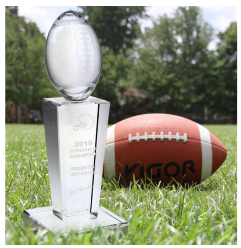
One Team Championship Trophy will be awarded One Player MVP Trophy will be awarded

Also 100% of North vs South Ticket Sales will be donated to the winning school's football program.